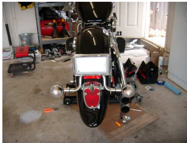
Original Plate and Signal